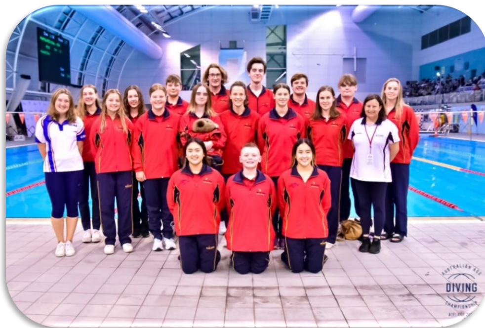
Diving South Australia – Age Nationals Team 2022